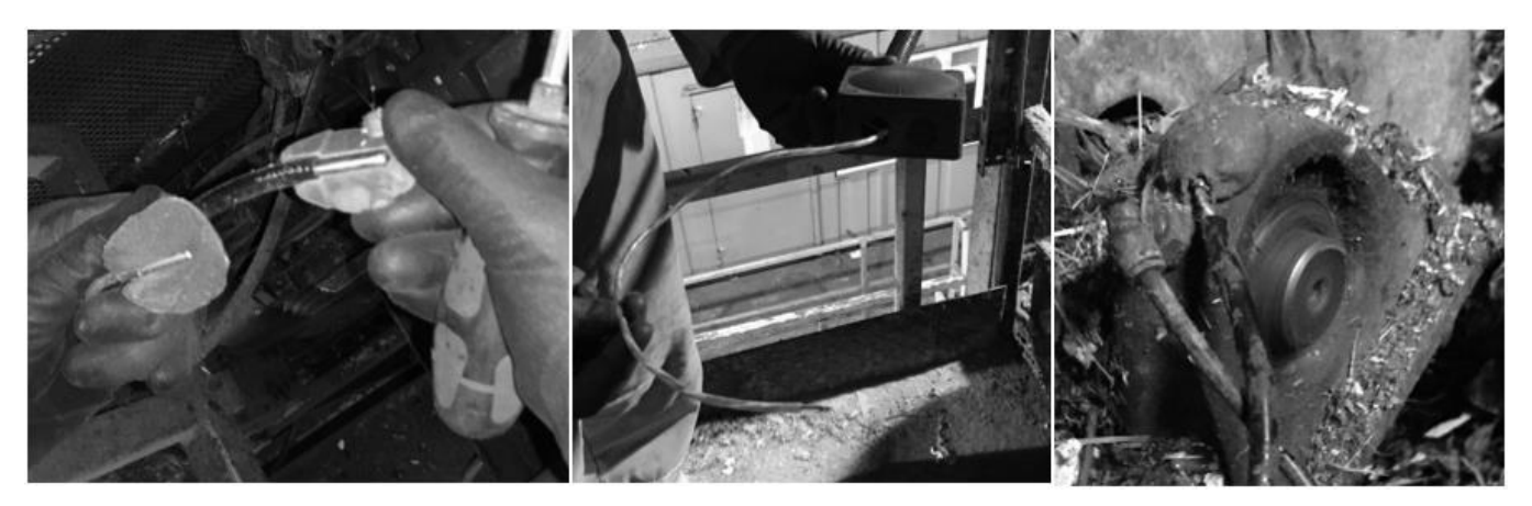
Figure 3 - Examples of RTD sensor issues encountered (l-r) sensor detachment, cable severing and sensor head damage

In addition to technical issues associated with the trial implementation cultural issues were also observed. Due to the technical issues encountered users were unable to develop confidence in the system thus limiting its utilisation within the Plant. Additionally, whilst trying to enact the significant operational change associated with the introduction of the system, regular operation was both continued and prioritised, for obvious reasons. Therefore, it proved difficult to obtain the personnel resources required to both maintain and support the introduction of the system on a continual basis. As identified in Section 4.3.4, personnel at the Plant are already fully utilised and thus no on site resource could be dedicated by the operator to ensure success of the system.