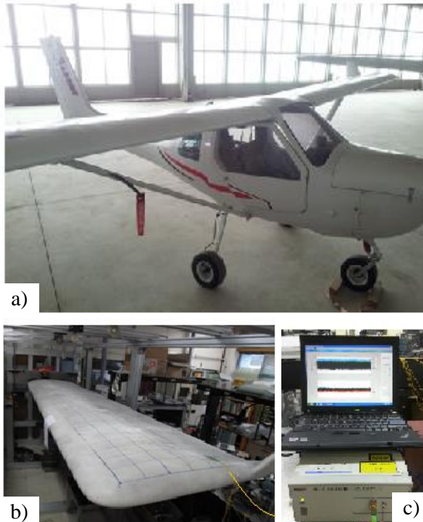
Figure 1. Experimental set-up: a) Jabiru UL-D aircraft, b) Jabiru's composite wing structure and c) data acquisition system.

Jabiru UL-D's, shown in Figure 1, (Jabiru Aircraft Pty Ltd, Australia) composite wing was used for the impact localization test. The experimental set-up of the composite wing used for the impact localization is shown in Figure 1. Three-multiplexed acrylic coated FBG sensors were attached on the upper surface of the wing with 45° angle orientation. Each of the sensor was used to localize the 20 impact delivered on the impact test region of the wing.